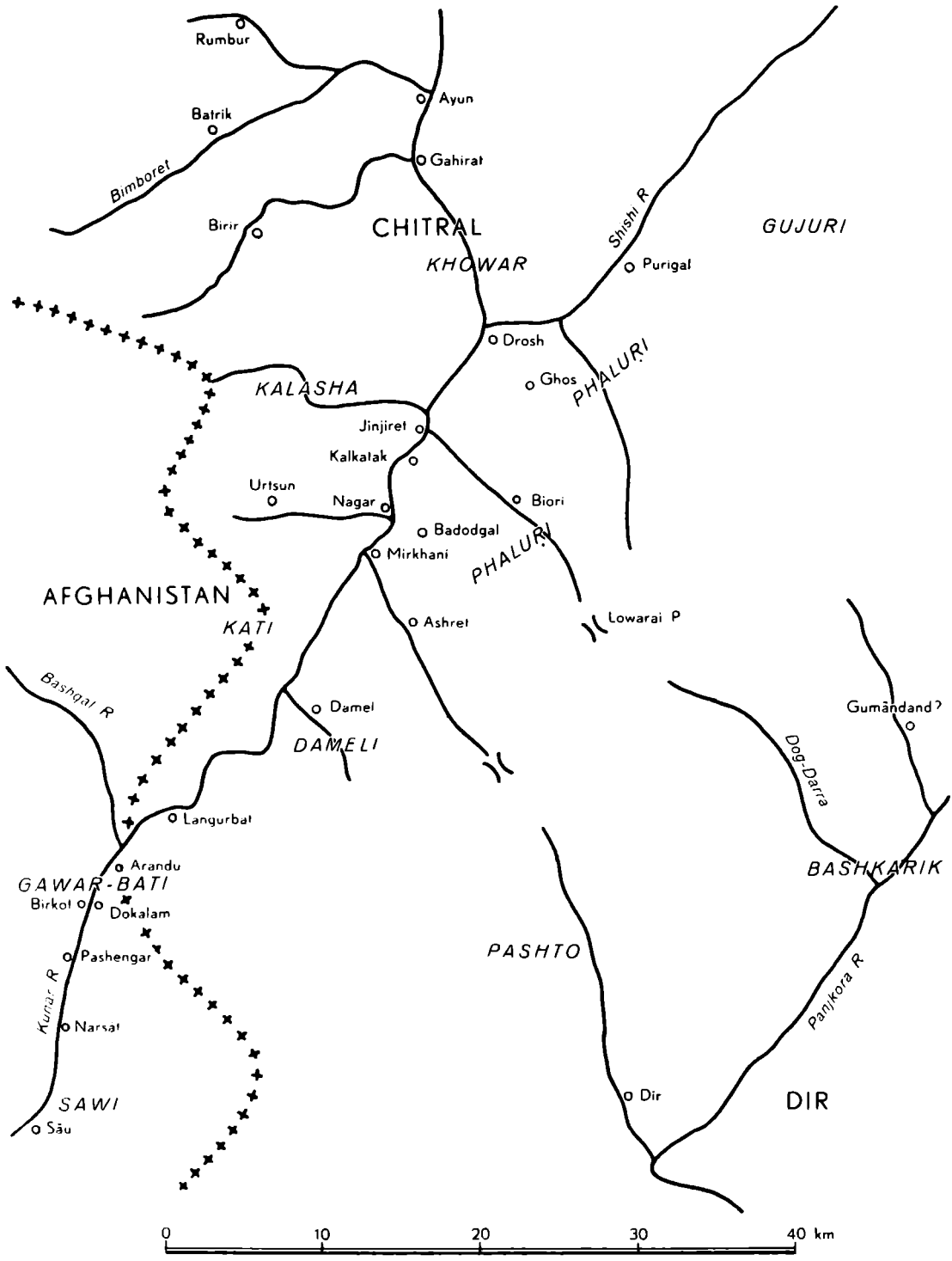
Sketch-Map of Lower Chitral.